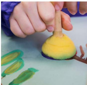
Early Childhood Art Education in Action: Stories from the Field Wednesday, June 4th | 7–8pm ET