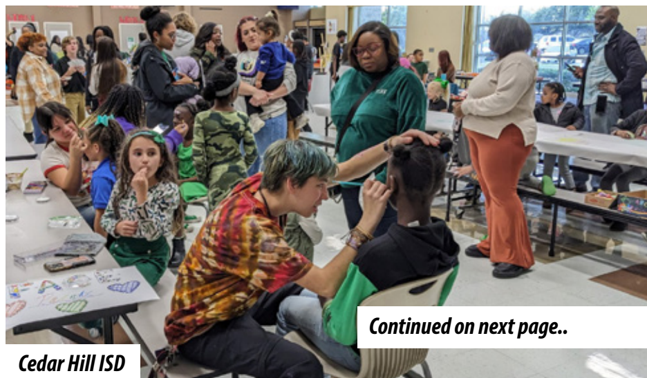
Cedar Hill ISD