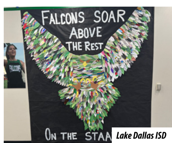
Lake Dallas ISD