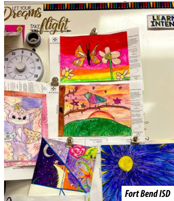
Fort Bend ISD