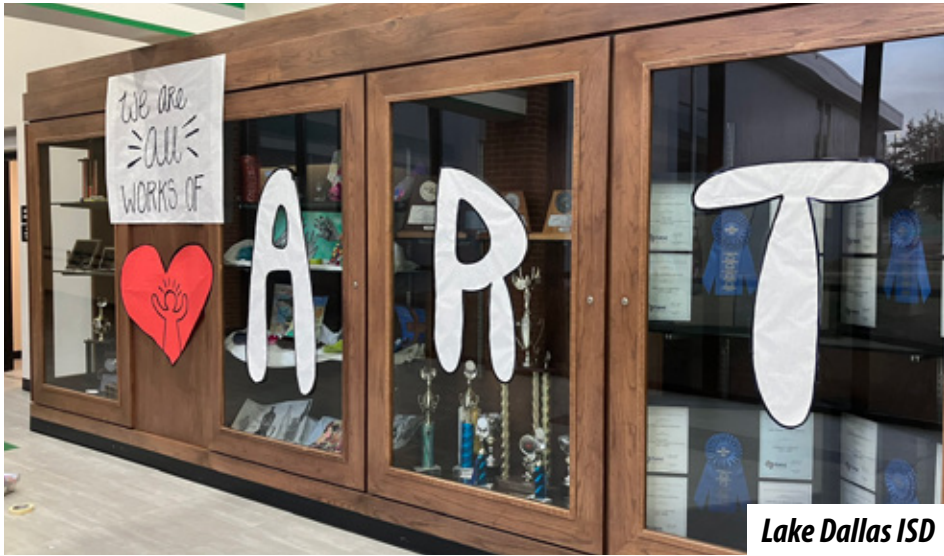
Lake Dallas ISD