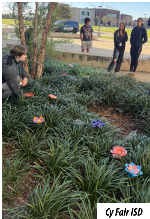
Cy Fair ISD