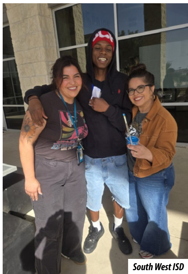
South West ISD