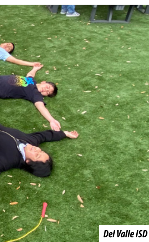
Del Valle ISD