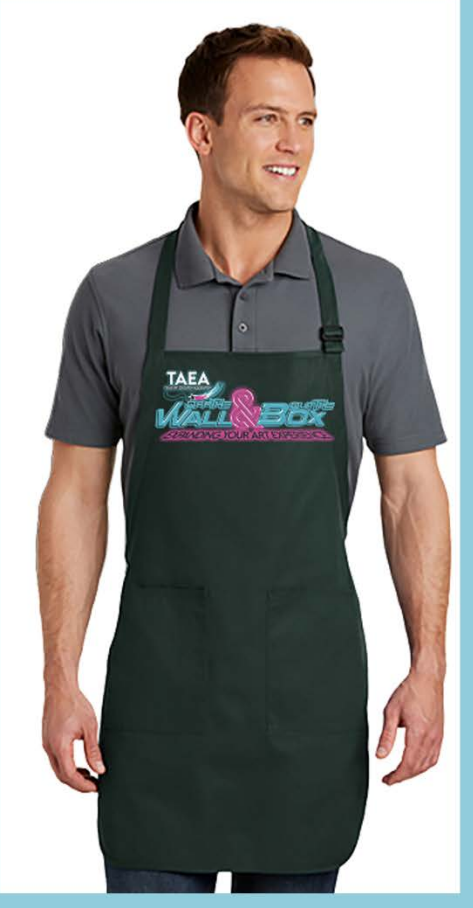
Purchase your TAEA Conference 2023 T-shirts and Aprons with your registration before October 23rd