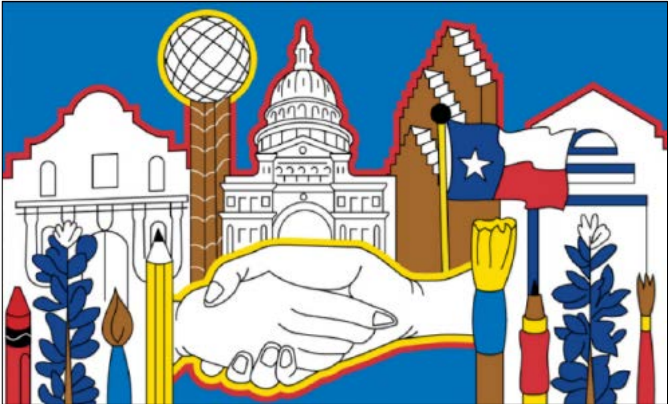
Cover art by Poojitha D., 8 th grade, Coppell ISD