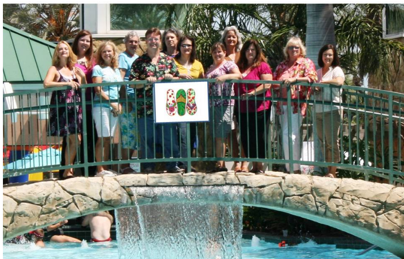
TAEA 2011 Conference Planning Committee