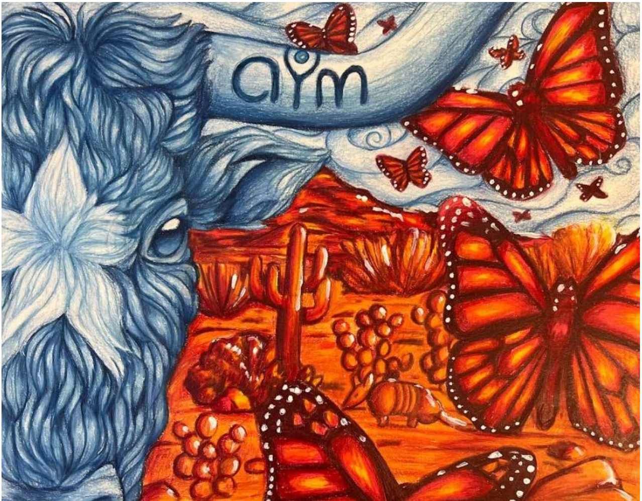
Cover Art by Celeste R., 12th Grade, Castleberry ISD